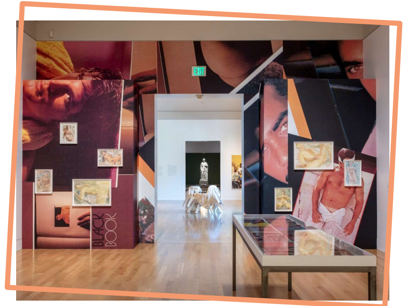
Installation view of Monica Majoli's work for Made in L.A. 2020: a version .