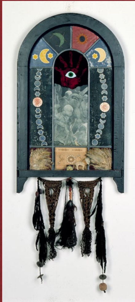
Betye Saar, Nine Mojo Secrets , 1971. Mixed media assemblage, 49.75" x 23.5" x 1.75". California African American Museum. Purchased by Foundation from Olga Addlerly in 1989

In Nine Mojo Secrets (1971), the artist Betye Saar used found objects to explore ancestral veneration, rituals, and symbolism from various traditional spiritual practices. Saar was inspired specifically by African art, utilizing various iconographic images and objects that represent power, healing, and magic. She combined personal symbols such as the lion that represents the artist's astrological sign (Leo) with references to Africa such as a magazine photograph of a traditional religious ceremony, as well as images with broad cultural significance like the all-seeing eye, the moon, and stars.