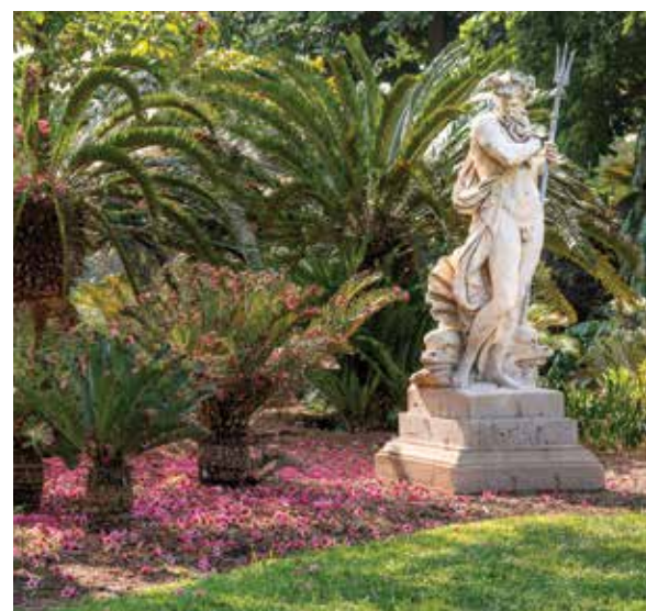
Garden Statuary.