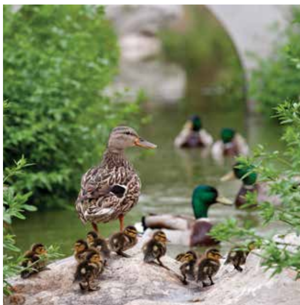
A duck and her ducklings.