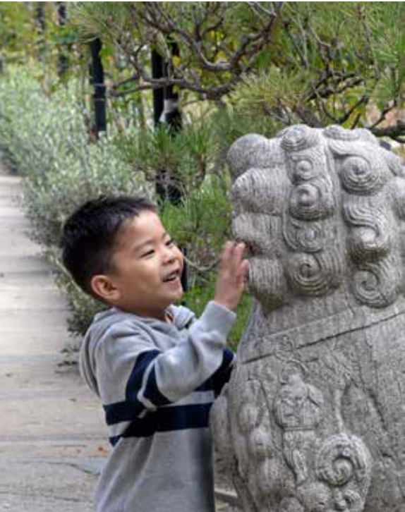
Young boy explores the Chinese Garden.