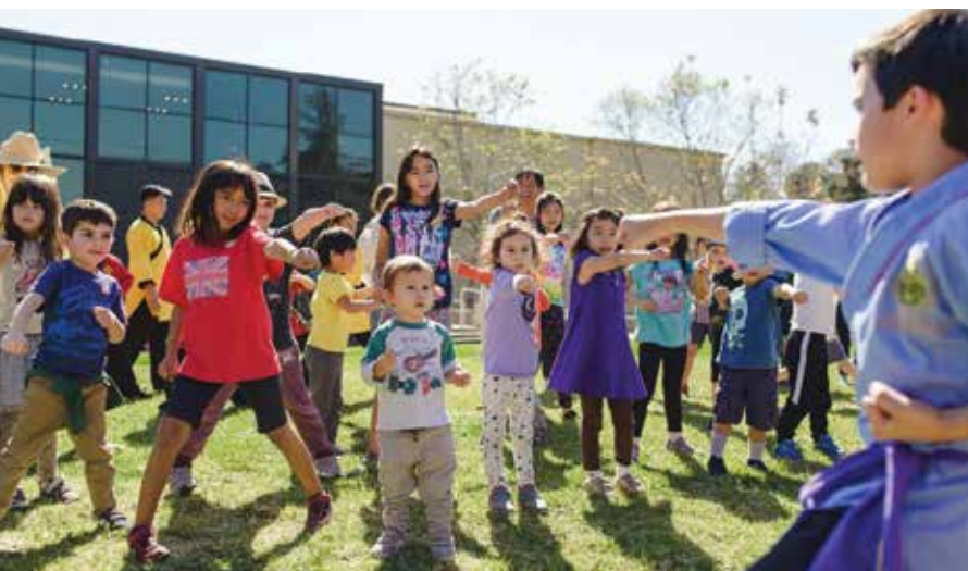
Children participate in a martial arts workshop at the Chinese New Year Festival.