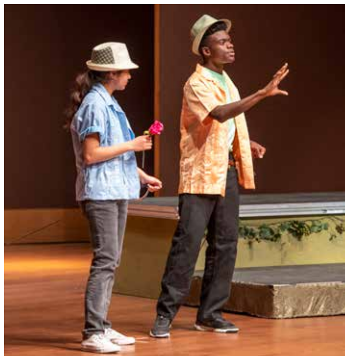
Top: Students make an art project as part of The Huntington’s Visual Voyages Deep Learning Days. Above: Students from Estaban E. Torres High School perform Shakespeare’s Romeo and Juliet in Rothenberg Hall. Opposite: Students tour with docents while attending The Huntington’s Visual Voyages Deep Learning Days.

The Huntington depends on its more than 1,200 volunteers who offer their time and expertise in the Library, art galleries, and gardens. They provided nearly 60,000 hours of their time this year, worth nearly $1.2 million. More than 80 teen volunteers worked on regular weekly assignments across the grounds, including in the Huntington Art Gallery, Herb Garden, and Chinese Garden.