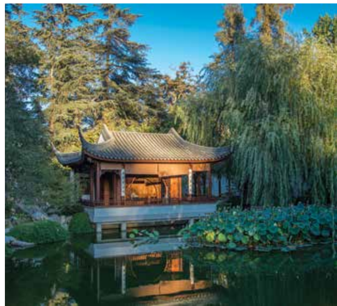
Left to right: Guests take selfies in the Rose Garden at the fifth-annual An Evening Among the Roses event. View of Chinese Garden.