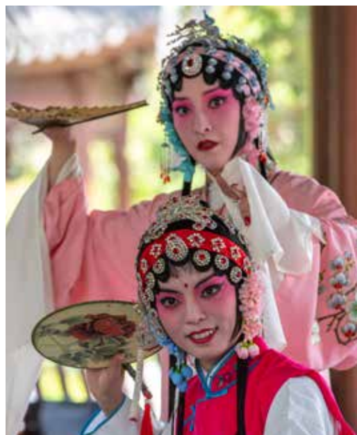
Top: Selections from The Huntington's holdings of William Blake material were on view at an exclusive presentation. Above: Kun Opera, one of the oldest forms of opera in China, is performed in the Chinese Garden. Opposite: Attendees enjoy an evening in the Chinese Garden as part of The Huntington's Harvest Moon Festival.