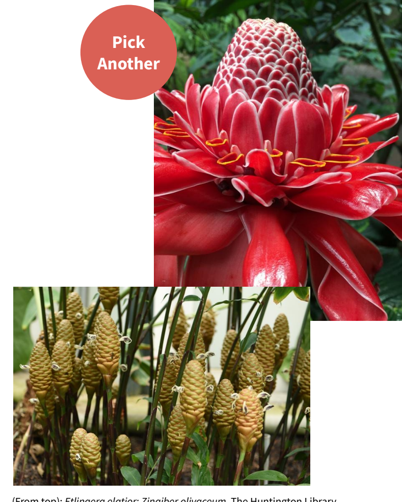
(From top): Etlingera elatior; Zingiber olivaceum. The Huntington Library, Art Museum, and Botanical Gardens.

Click on this link to explore more View a recipe from 1954 that uses ginger