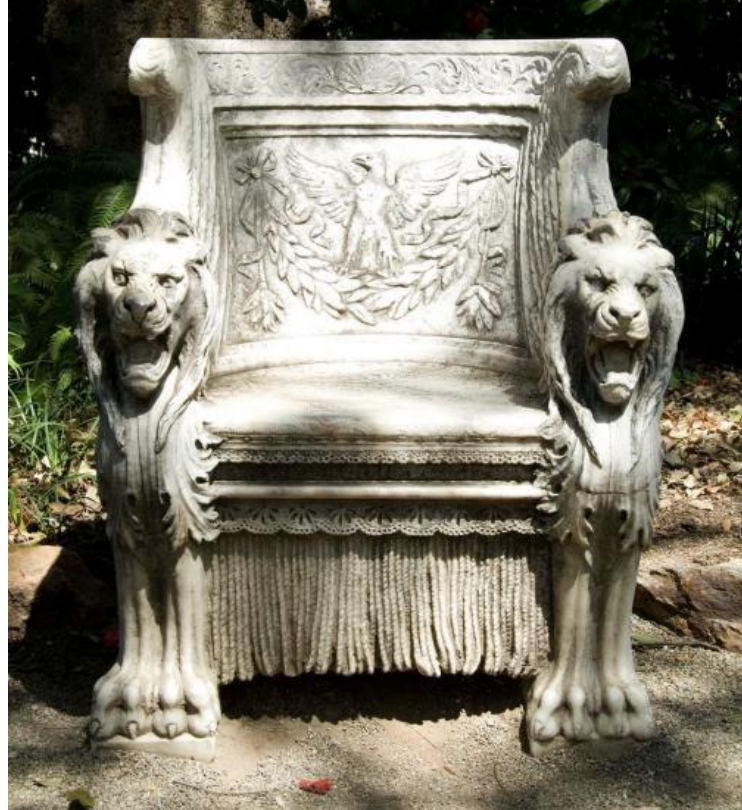
Antonio Natali, Seat of Honor , ca. 1870–1918, marble. The Huntington Library, Art Museum, and Botanical Gardens. Zoom in to the chair