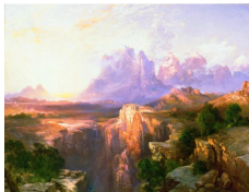
Rock Towers of the Rio Virgin, Thomas Moran