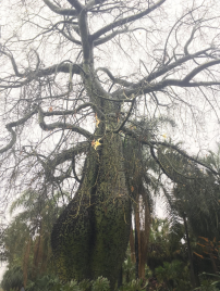
★ Silk-Floss Tree