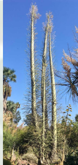
★ Boojum Tree