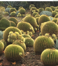
★ Golden Barrel Cactus