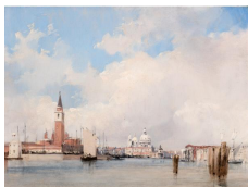
View in Venice, with San Giorgio Maggiore, Richard Parkes Bonington