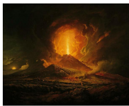
Vesuvius from Portici, Joseph Wright of Derby