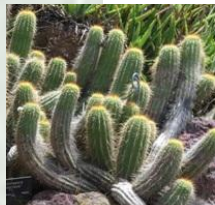
★ Echinopsis Cactus